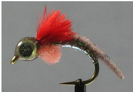
An alevin pattern.

Taking a break from tying recently, I decided to look up "Fly Fishing Terminology" on the Internet. Was I ever amazed! There were sites for Japan, England, Europe, Ireland and the good ol' USA. Let's not forget "fly tying." WOW! After glancing at some of those definitions I figured I could enhance or come up with my own definitions for a few of them. So I picked out ones that I thought really needed some new definitions and here they are. Some of you, after reading this list, may think that I may have tied one too many flies or left the caps off the Fish Glue, Zap-A-Gap and head cement. Nevertheless, here they are.